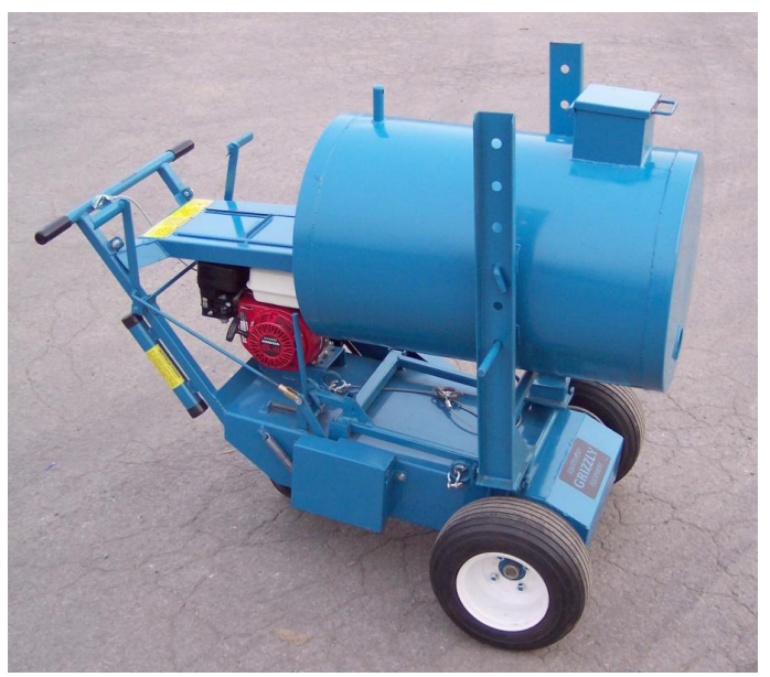
Fig. 7 Hot stuff tank attachment