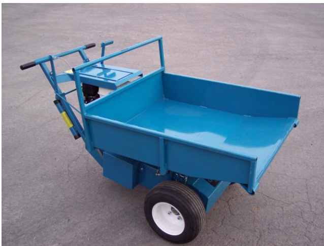
# 340 400 Platform