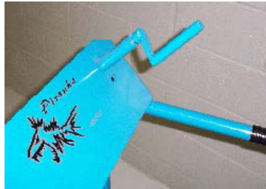
Fig.5 Depth control in operating position