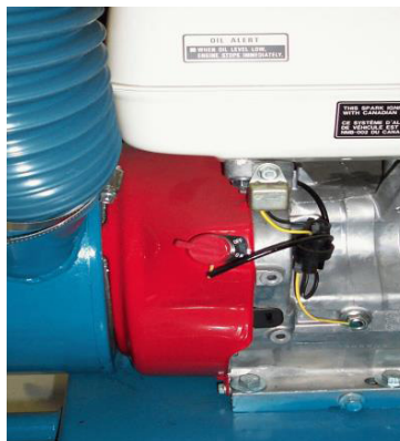
Fig.7 shut-off switch

Be sure to test the shut-off switch before depending on it (see Fig. 7), the shut-off switch is located on the back-side of Honda engine.