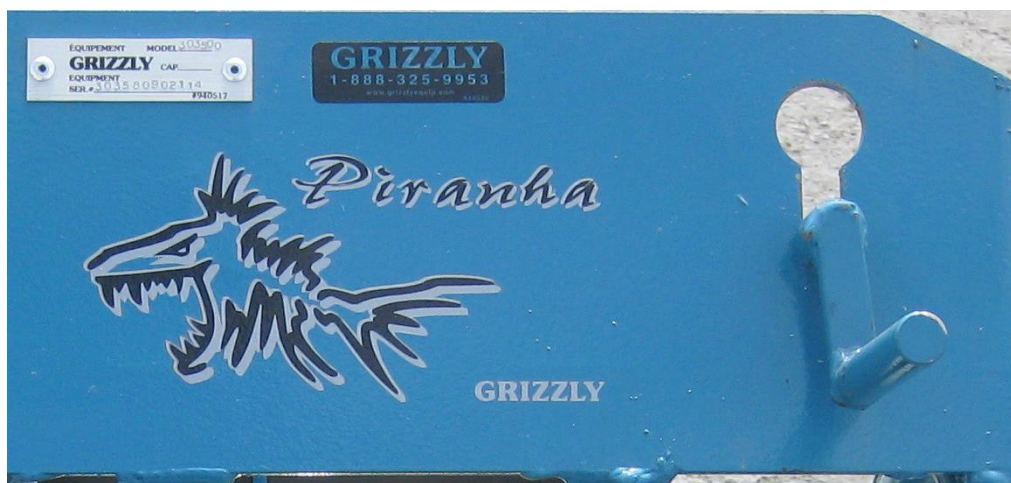
Fig.3 : Roof Cutter in idle position

After checking the blade installation (refer to the blade installation section), put the depth control in the idle position and make certain the control is set so that blade does not come in contact with the roof deck (Fig. 3) Pushing down on the handles will allow the depth control to slide to the idle position.