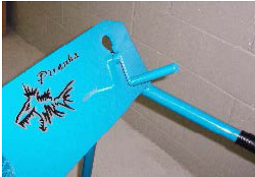
Fig.4 Depth control in idle position

The depth control (see Fig. 4 and Fig. 5) is located on the right side of the handle assembly. Figure 4 shows the control in the idle position and figure 5 shows the cutting position. Turning the crank clockwise adjusts the cutting depth lower; counter-clockwise rotation of crank raises the cutting blade. Operator must be familiar with operation of this control before using roof cutter on the job.