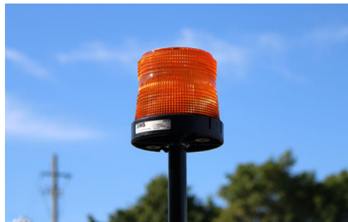
KER-ACCE8140B Amber strobe light