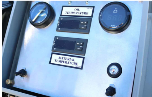
KER-ACCPEATCPB Automatic temperature control with electronic ignition, battery and charger