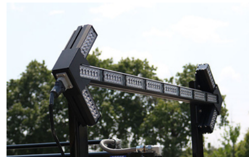
KER-ACCE1025B Flashing LED arrow stick advisor