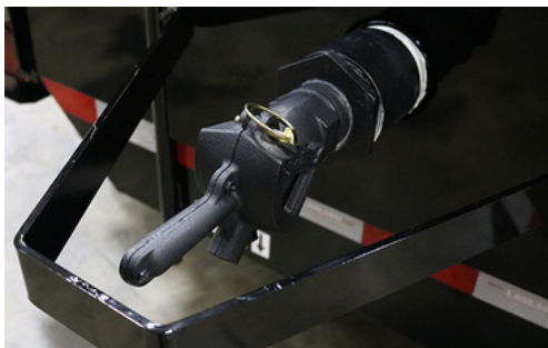
KER-ACCE8300B 3" Molasses valve