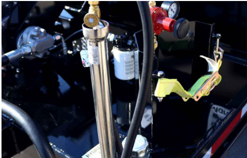
KER-ACCE8200B 300,000 BTU Vapour propane torch with 15' propane hose & bottle holder