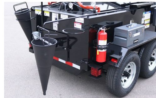
KER-ACCE0304B Bucket bracket extension

ORDER NOW : 1-888-325-9953 / ORDERS@GRIZZLYASE.COM