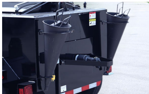
KER-ACCE0302B Bucket holder