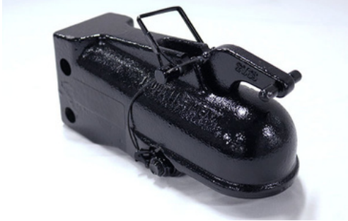
KER-ACCE8109B 2-5/16" Ball hitch