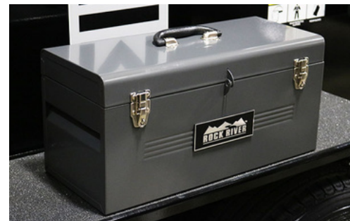
KER-ACCE1147B Tool box installed on trailer