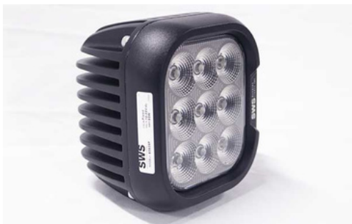
KER-ACCE1010B LED Work light installed