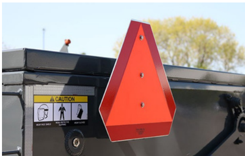
KER-ACCE1027B Slow moving vehicle sign