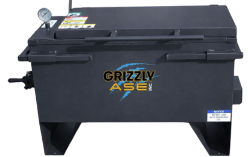
KER-ACCE9999C Alternate standard paint colour