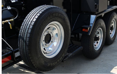
KER-ACCETIREB Spare tire and rim mounted to trailer