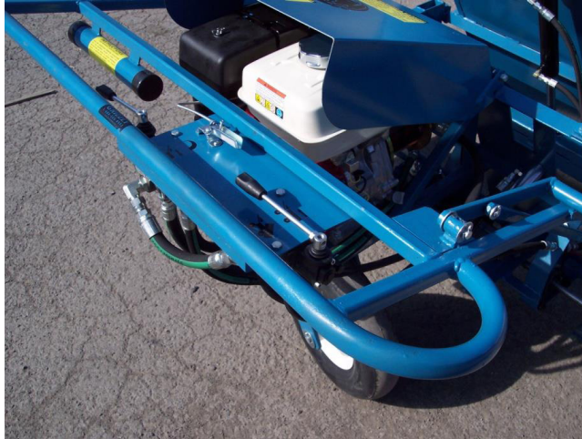
Fig. 9 All levers on neutral, brake on

At this point, after you have read through all of the instructions, the workhorse should be ready for operation.