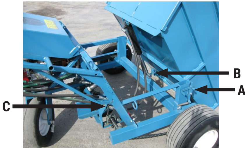
Fig. 6 Dump tray (or felt & insulation carrier)