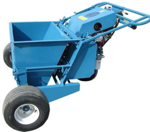
Fig. 5 Gravel spreader

Wrenches are required for installation. Install gravel spreader as shown in fig. 5. Shaft ends of spreader drop into mount brackets on the frame. To install handle and linkage, first attach linkage to dispenser and then connect the other end with handle and secure with bolt and nut provided. Clockwise adjustment of the screw will make dispenser door open less; counter-clockwise makes door open more. Yoke assembly on back of dispenser is preset to proper door tension. If more tension is needed for door closure, remove the bolt and nut on the yoke and tighten as needed.