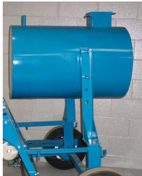
Fig. 8 Hot stuff tank attachment

Install channel irons, tank and rods as shown in Fig. 8 (Refer to operation section on use of hot tanks)