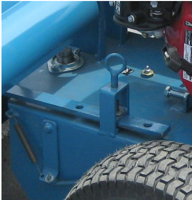
Fig. 3 Brush direction control

WARNING; ALWAYS DISENGAGE BRUSH WHEN SWEEPER IS NOT IN OPERATION. NEVER LEAVE THE SWEEPER UNATTENDED WITH THIS LEVER ENGAGED.