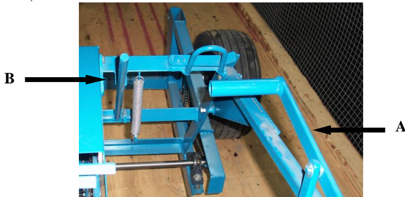
Fig. 4 A- Gravel dispensing lever B- Dump hopper released lever

Gravel dispensing lever is located furthest to the right (Fig. 4.) Pulling back on handle opens discharge door of gravel dispenser. Pushing forward on lever closes door. For instructions on installation of linkage and lever, refer to next section (Gravel spreader attachment)