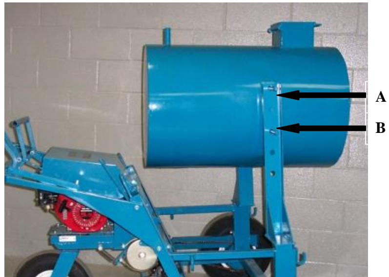
Fig. 7 Hot stuff tank attachment

Install channel irons, tank and rods as shown in Fig. 7 (Refer to operation section on use of hot tanks)