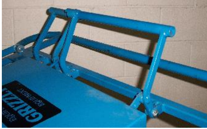
Fig. 8 Levers in brake on, clutch disengaged position

Make sure the clutch and brake levers aren't being pulled back (held) against the handle bar (pulling on the brake lever will release the brake and pulling on the clutch lever will release the brake and engage the clutch) (see fig. 8).