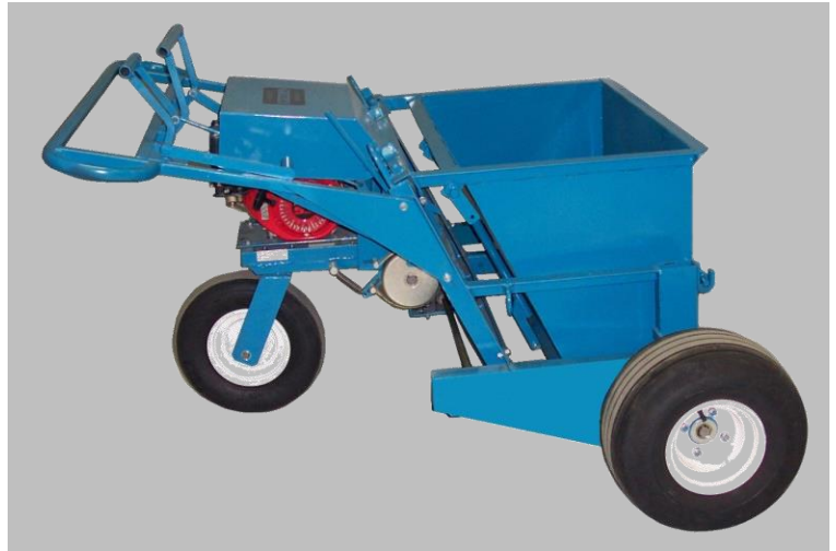
Fig. 5 Gravel spreader

Wrenches are required for installation. Install gravel spreader as shown in fig. 5. Shaft ends of spreader drop into mount brackets on the frame. To install handle and linkage, first attach linkage to dispenser and then connect the other end with handle and secure with bolt and nut provided. Clockwise adjustment of the screw will make dispenser door open less; counter-clockwise makes door open more. Yoke assembly on back of dispenser is preset to proper door tension. If more tension is needed for door closure, remove the bolt and nut on the yoke and tighten as needed.