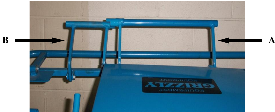
Fig. 3 Power unit controls A- Clutch handle B- Brake handle

To go forward, pull back on clutch handle. Brake will release automatically as clutch is engaged. To stop, release clutch handle and clutch will disengage as brake comes on. Speed is controlled by throttle setting and the degree to which the clutch is engaged. For maximum belt life clutch should be fully engaged during operation. Pulling back on the brake handle only will allow the operator to push/pull the unit without engaging the engine, releasing the brake handle will automatically engage the brake.