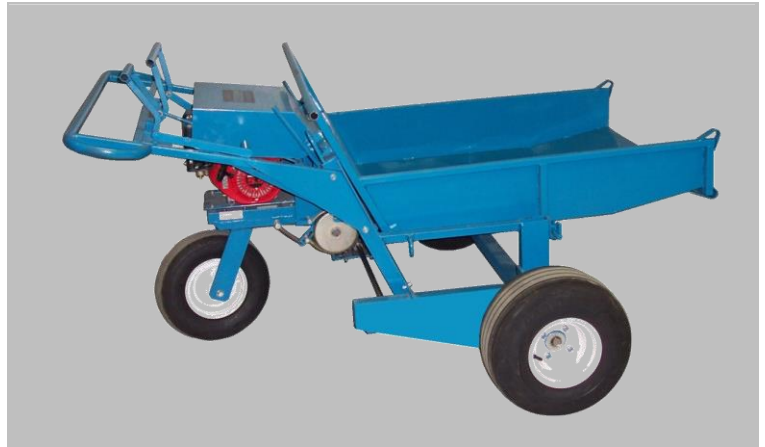
Fig. 6 Dump tray (or felt & insulation carrier)

Install dump tray as shown in fig. 6. Shaft ends drop into mount brackets on sides of power unit. Hopper is self-locking: releases with lever to right of engine cover